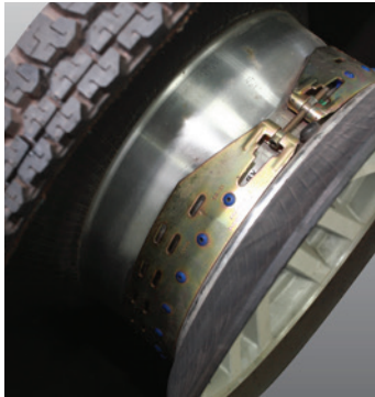
Tire retention system