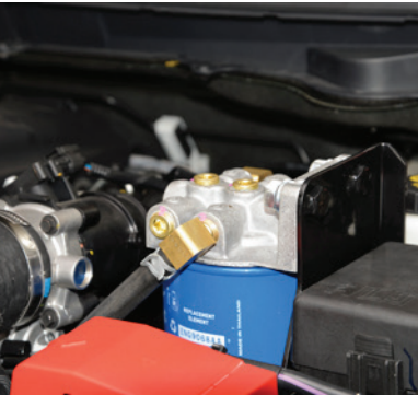
Enhanced fuel filtration system