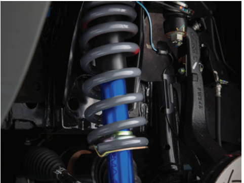
Dynamic suspension (high load)