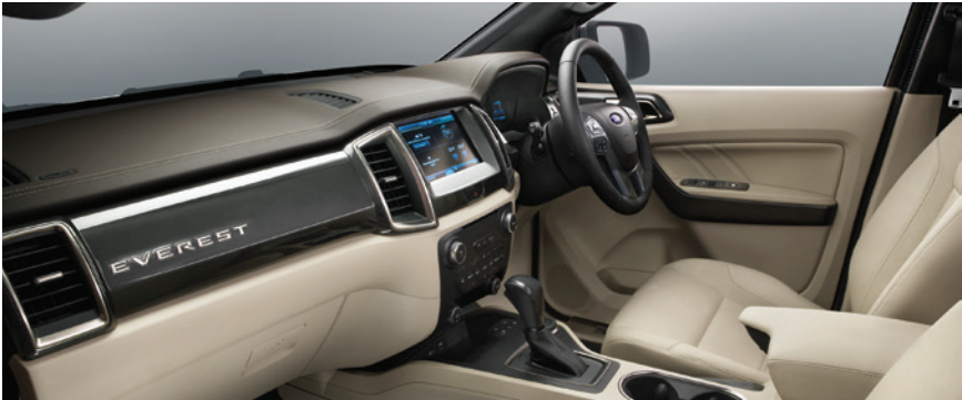
Ford Everest interior