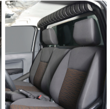
Roll over protection system (ROPS)