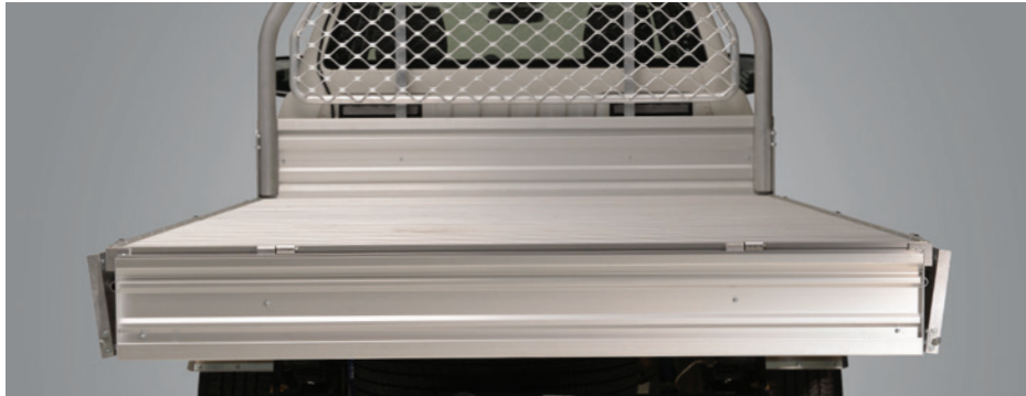
Triple-folding dropside tray