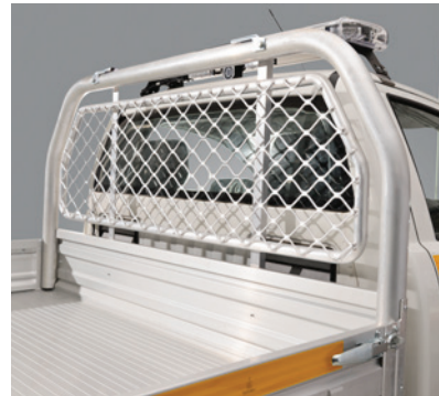
Tubular loadrest with mesh rear window protection