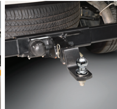
Tow ball with trailer plug