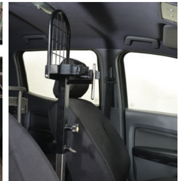
In car rack