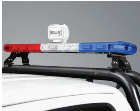
LED light bar