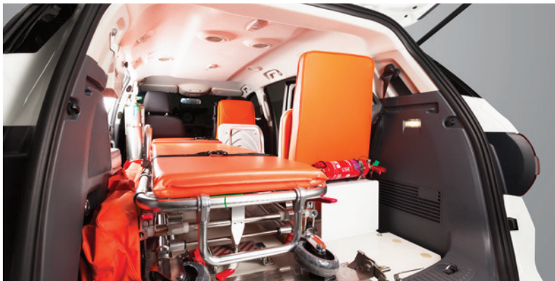
Single stretcher with double attendant seats, storage cabinet