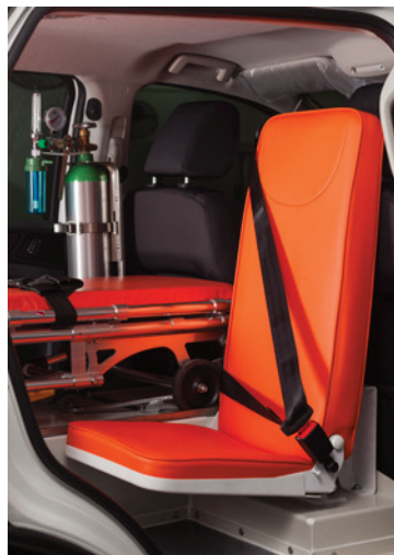
Folding attendant seats