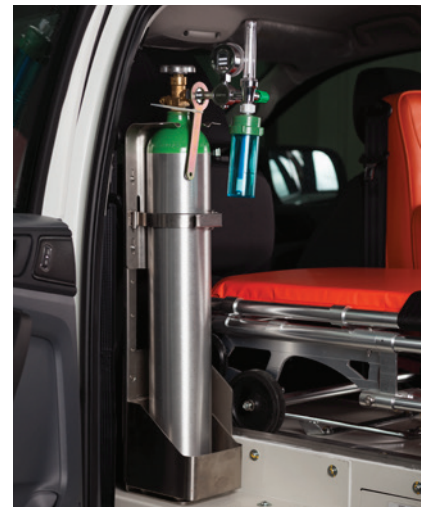
Oxygen cylinder (MD size) with regulator

Contact RMA Automotive for more information or a quotation.